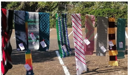
KZN KnitWits and WMC Social KnitWits

In support of Nelson Mandela Day on Tuesday 18 July, scarves were handed out to all the men who attended the Vulindlela / Soup Kitchen project. This was made possible by the '67 Blankets for Nelson Mandela Day' organisation.