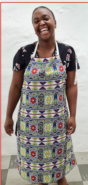
A beautiful apron made by one of the ladies at the Sewing Empowerment group.