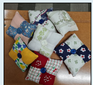
Pin Cushions made